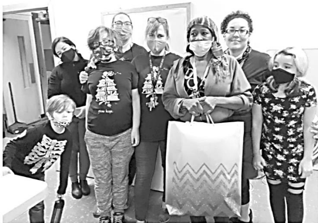
Food distribution staff at Hope

On Saturday, November 14, the Reading Chapter of the NAACP met for its 33rd annual Freedom Fund Gala - virtually, of course. Meals from "Grill Then Chill" were delivered to the homes of attendees. Following the meal, awards were presented to local organizations for their racial justice efforts. The Gala theme was, "We Are Done Dying."