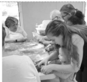
Good Shepherd, Reading

As you can see from the article above, these projects can take place throughout the year!